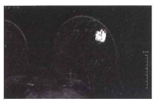
Figure 1 Enhancing Left Breast Mass.

Imaging was repeated in the sagittal and axial planes, confirming good positioning of the bowl within the enhancing mass ( Figure 4 ). Multiple specimens were obtained after the Mammotome<sup>®</sup> MR probe was positioned on the cradle. They were easily retrieved at the collection chamber of the probe. Ten specimens were obtained at various locations.