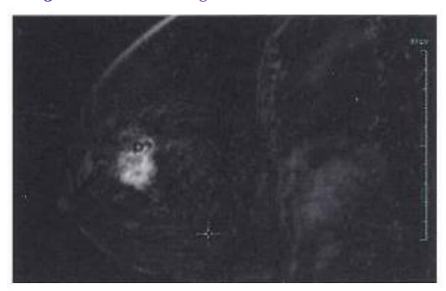
Figure 4 Probe Documented in Lesion.

a division of DEVICER MEDICAL PRODUCTS, INC.